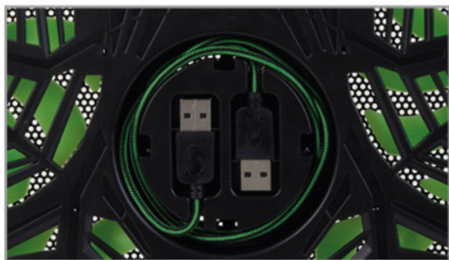
Storage compartment for cable